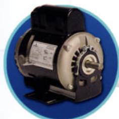
Motor Heavy Duty Instant Reversing Continuous Duty