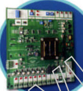
Diamond Control Board Easy to use & State-of-the-art Advanced Features Come Standard Built-in Lightning & Surge Protection