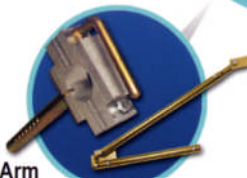
Quick-Release Swing Arm Simple & Secure No-Pinch Design for Added Safety